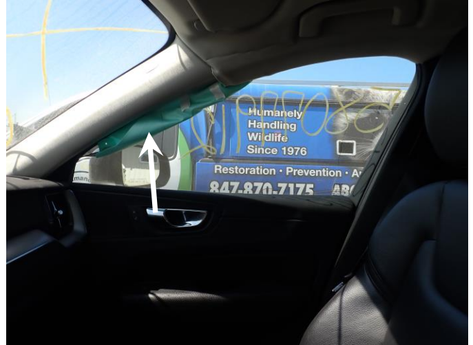
Passenger side interior