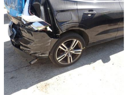
Rear end damage