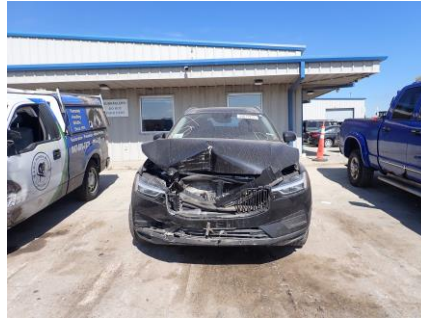
Front end damage